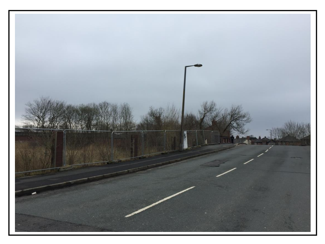
Photo 2 – view looking northwards along the western boundary of the site on Ashton Hill Lane

Photo 1 – view looking north eastwards along Manchester Road towards the south eastern corner of the site