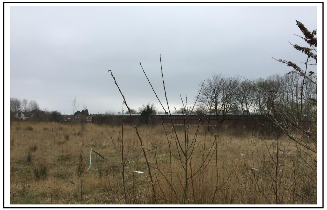
Photo 4 – view of Ashton Canal which runs parallel with the southern boundary of the site