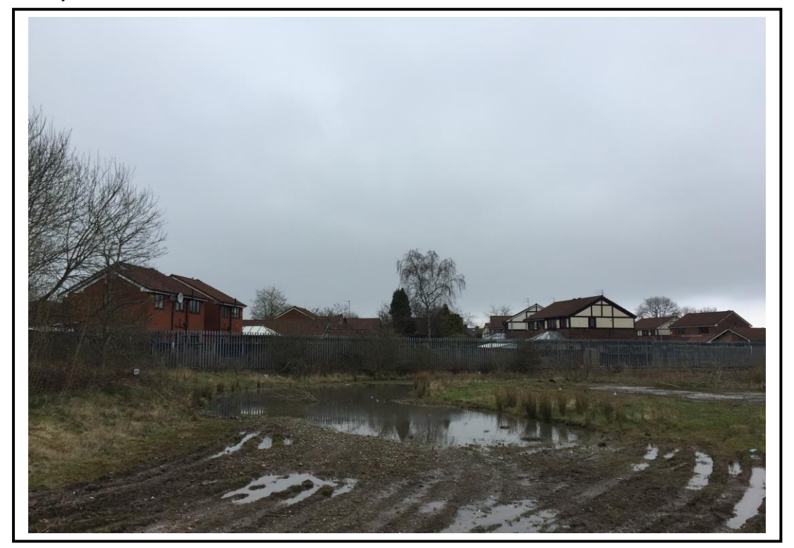
Photo 6 – view looking eastwards towards adjacent rugby ground to the east of the site

Photo 5 – view of properties to the north of the site (located on Willow Fold) from within the site